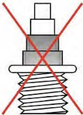
Tree - NO

Spike length for both track and field events (LJ and TJ) is limited to 6mm . All spikes should be pyramid or cone shaped. No "tree" or "pin" type spikes will be allowed. This rule will be strictly enforced at all times, including both practice and competitions.