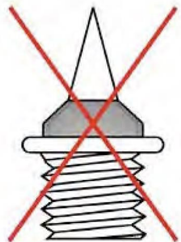
Pin - NO